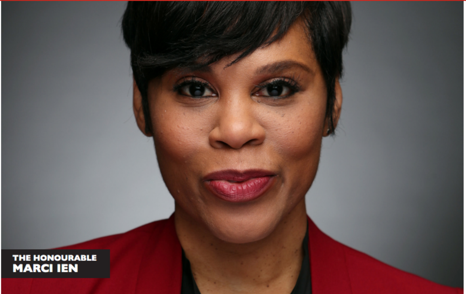
THE HONOURABLE MARCI IEN

Please join Inclusive School & Community Services' Dismantling Anti-Black Racism Team for a riveting conversation